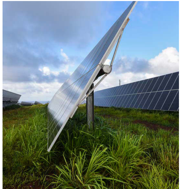
AES Lawai Solar Project- Kauai.

Hawaii State Energy Office. 2018. "Energy Planning Overview." 2018. https://energy.hawaii.gov/energyplanning/overview .